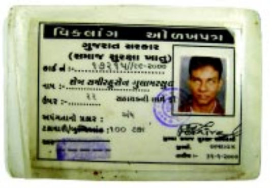
A sample of an ID Card

In order to avail various benefits for travel, scholarships, concessions, etc. under the State/Central schemes for persons with disabilities, one needs an Identity Card. This Card is issued by the Department of Social Defence. In every district there is a Social Defence Officer whose office in most places is located in the Zila Panchayat Office.