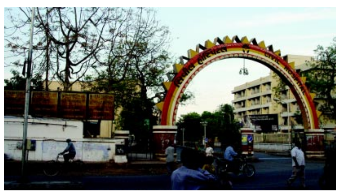
Entrance to the Civil Hospital, Ahmedabad